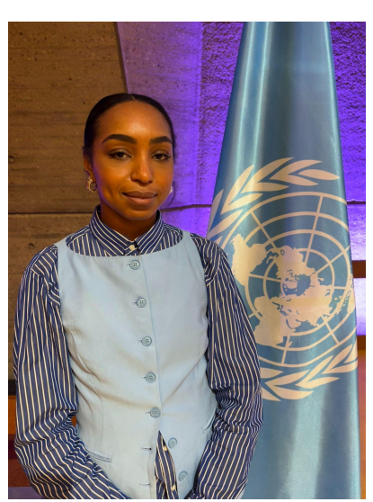
Rania Sabo UNESCO